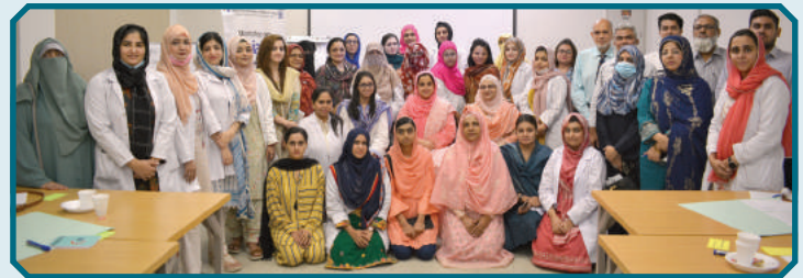
Celebrating World Family Doctors Day for Geriatric Capacity Enhancement

assessment of elderly patients in their clinical setting. Our faculty received an overwhelming response and outstanding feedback from the participants for this workshop.