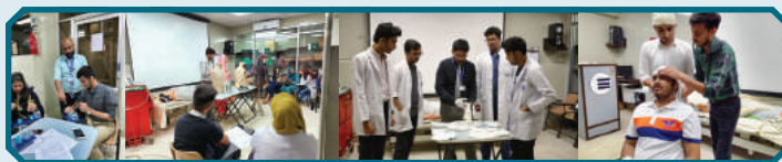
LNMC Student Activities

Research and Skills Development Center conducted multiple sessions for the students of LNMC 1 st year, 2 nd year, 4 th year and 5 th year in the month of May to August 2023. Sessions were planned to enhance their skills according to the latest guidelines which include ECG Changes MI, Changes Of Arrhythmia, Urinary Catheterization (Male and Female), Subcutaneous Injection Technique, Cape line Bandages arm sling and care of amputated digit figure of eight bandages and splinting, Prostrate examination, Per Vaginal Examination, Relief of choking (Adult), Lungs sounds, Technique of Open