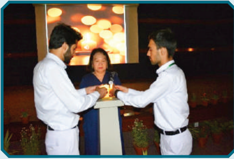
Students Lighting the Lamp

regarded as the founder of modern nursing. The ceremony formally initiates students into the noble profession of nursing as they take the oath to serve humanity with care and compassion without any discrimination. A total of 108 B.S. Nursing (Generic) students, which included the newly inducted