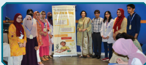
Creative Writing Competition Members

Overall, the competition was very well received and the participants look forward to similar events in the future.