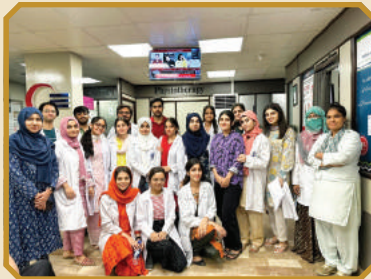
LNH Medical Facilities at Shah Faisal

As a part of the additional one-third curriculum in the reproductive module, the Department of Family Medicine arranged a visit to Shah Faisal LNH outreach center for 2 nd year MBBS students in 4 divided groups. Students