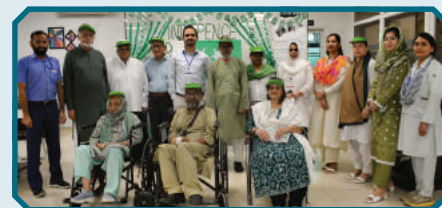
Senior Citizens and OPD Management Unite to Paint Independence Day's Canvas with Joy