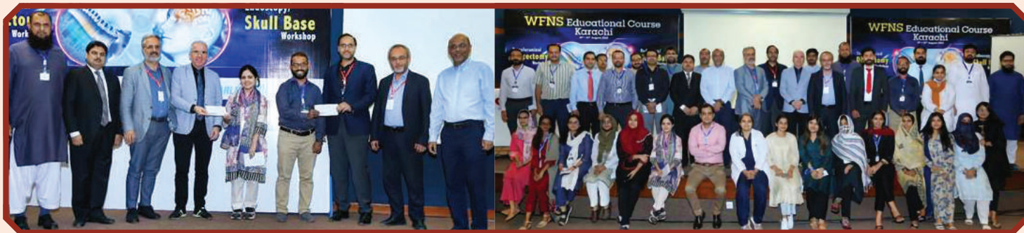
Participants at WFNS