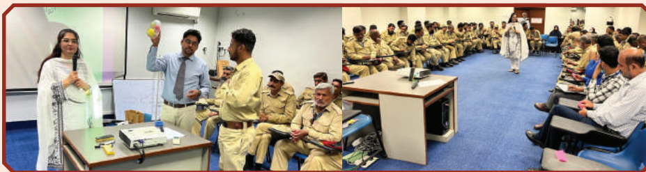
Soft Skills with Security Department

Research and Skills Development Centre conducted sessions for security guards in March 2023 to enhance soft skills and a total number of 200 participants attended the session. The topic of the sessions were: stress management and how to deal with rude behavior.