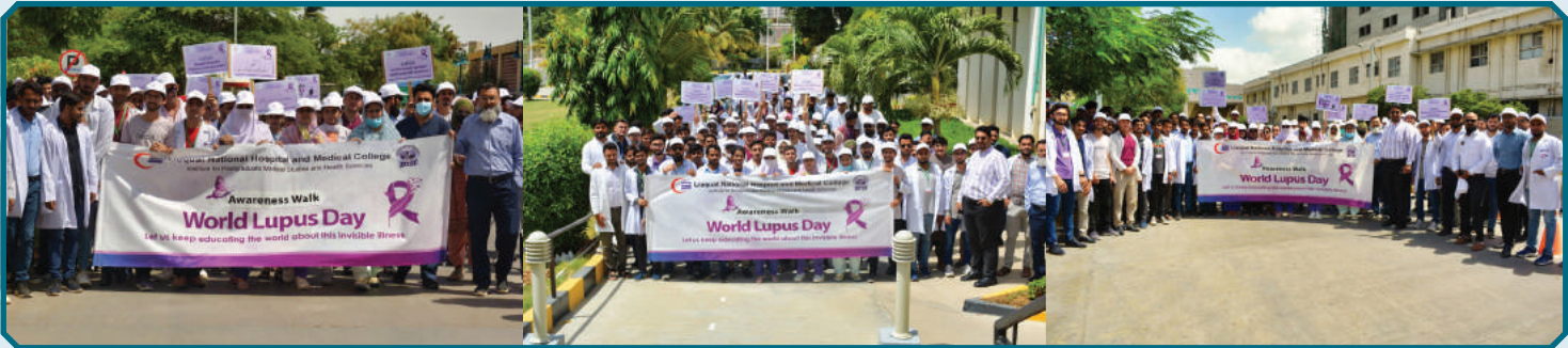
Awareness Walk on World Lupus Day

more common in young females and initial presentation can be non-specific, e.g. fever, easy fatigue, weight loss, joint pain, non-specific rashes etc. These symptoms are also present in other diseases and lead to delay in correct diagnosis (continue on page 4)