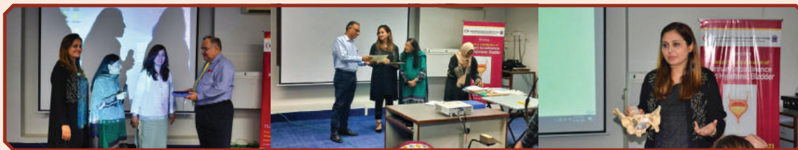
Geriatric Consideration of Urinary Incontinence and Hypotonic Bladder

actively engaged in the discussions and demonstrations, making the event not only informative but also enjoyable.