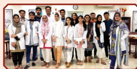
Batch 2027 Explores Elderly Care