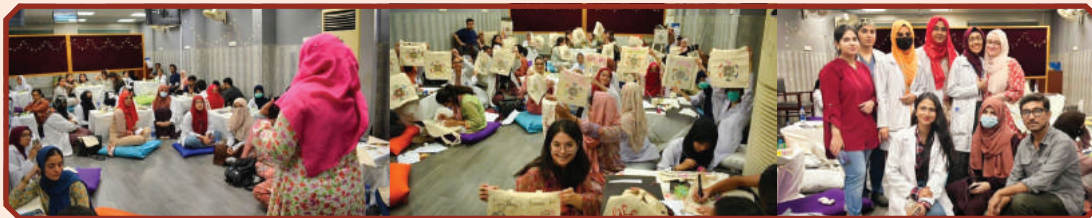
Art Therapy by Art & Culture Society

The event began with an innovative "mind dumping" activity, creating a safe space for participants to unload their thoughts, setting the stage for a transformative journey of self-expression. The room buzzed with creativity as the tote bag painting