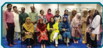
Group Photo of Organizing Team

The department of Family Medicine held its annual OSCE for the Post Graduate Certificate course. Candidates were assessed for their consultation and examination skills after a yearlong blended learning course.