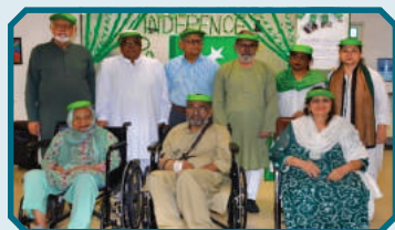
Celebrating the Spirit of Independence: Spreading Joy among our Cherished Senior Clients on the Eve of August 14 th