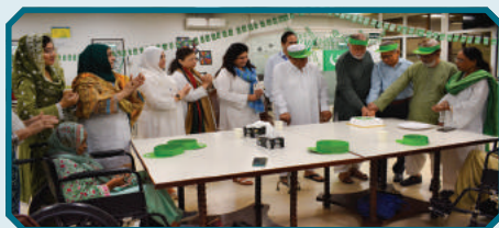
Celebrating Independence Day Sweetness with our Senior Citizen Clients: A Joyous Cake-cutting Moment to Savor