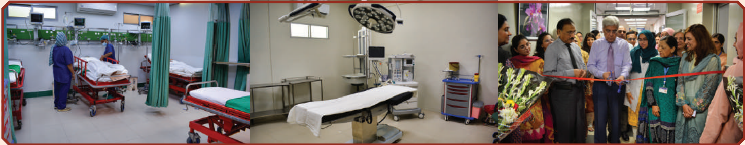
Inauguration of New Gynae Theater and Recovery Area

state-of-the-art facility stands as a remarkable step forward in our commitment to providing exceptional care & advancing medical services for women. This new facility is well equipped with the latest medical technology, including a 4K Laparoscopic System, allowing our dedicated team of gynaecologists to perform complex surgeries with precision, ensuring the best possible outcomes for our patients.