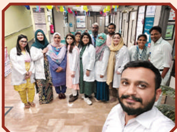
Fun-Filled Health Fair- The Core Family Medicine Outreach Team

Organized by the Department of Family Medicine on the occasion of World Family Doctors Day, at LNH Shah Faisal Outreach Centre.