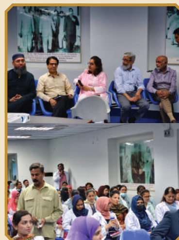
World Hepatitis Day