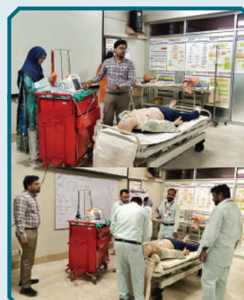
N-AART Session with Nurses