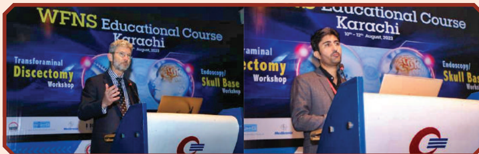
Speakers at WFNS

To equip aspiring neurosurgeons in Pakistan with modern knowledge and training, the Department of Neurosurgery at