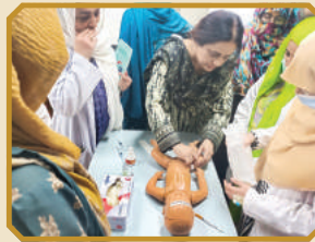
Hands on Practice of Examination Skills

These sessions covered consultation skills, clinical case discussions, interpretation of ECG, X-rays, and hands-on practice of examination skills on simulated patients. The participants greatly appreciated this learning activity as it helped in enhancing their clinical skills which they can apply in their practice to benefit patient care.