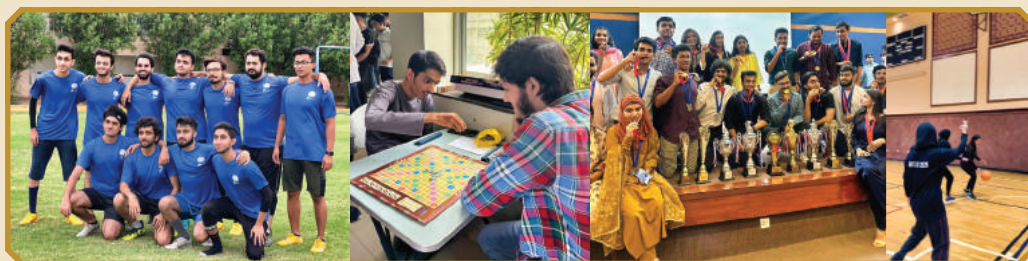
LNMC Sports Fest

In August, the LNMC sports society hosted "Sports Fest 23" for students. Indoor competitions for chess and scrabble, 8-ball pool, table tennis, and e-sports were held throughout the first week. Some of these events had