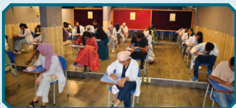
Creative Writing Competition Participants

The LNMC Magazine Society – English Section organized the first ever Creative Writing Competition for