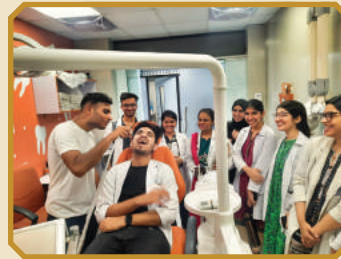
LNH Dental Clinic at Shah Faisal

As a part of the additional one-third curriculum in the reproductive module, the Department of Family Medicine arranged a visit to Shah Faisal LNH outreach center for 2 nd year MBBS students in 4 divided groups. Students