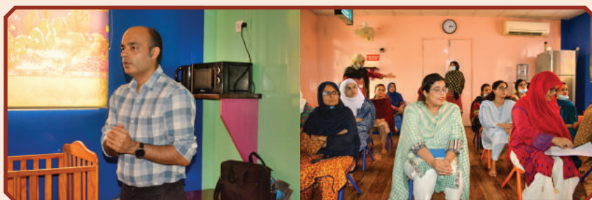
Importance of Early Intervention at Baby Day Care Center

As now, children are kept busy with the early exposure to TV and mobiles this screen time kills the physical and experiential learning time, which creates a hinder in the learning process.