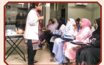
Hands-On Practice Session: Strengthening Examination and Consultation Skills

A blended learning course on Evidence based management of primary care was organized by the Department of Family Medicine to upgrade knowledge and skills of non-communicable diseases management among primary care providers. Weekly interactive sessions by faculty were conducted on Zoom every Saturday along with quizzes and assignments. Participants were also provided an opportunity for hands-on practice of examination and consultation skills during physical contact sessions.