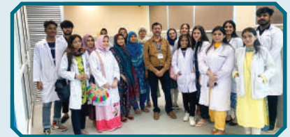
Students of SZABIST

This internship program became more popular in the education sector with the start of 2023 and more students and universities and institutes have started approaching the department. The department of Molecular Pathology arranged study tours for students from various institutes and universities which were very much appreciated.