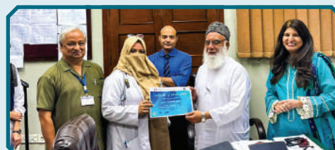
Certificate Distribution MSOL 2022