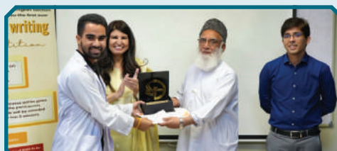
Prize Distribution Creative Writing Competition