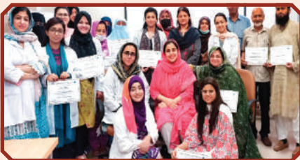
Empowering Primary Care: Evidence-Based Management of Non-Communicable Disease

A blended learning course on Evidence based management of primary care was organized by the Department of Family Medicine to upgrade knowledge and skills of non-communicable diseases management among primary care providers. Weekly interactive sessions by faculty were conducted on Zoom every Saturday along with quizzes and assignments. Participants were also provided an opportunity for hands-on practice of examination and consultation skills during physical contact sessions.