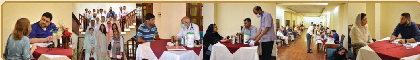
Free Medical Camp at the Karachi Gymkhana

exclusive access to expert medical advice and thorough basic health checkups. Gymkhana members appreciated the efforts of Liaquat National Hospital and anticipated to organize more health initiatives together.