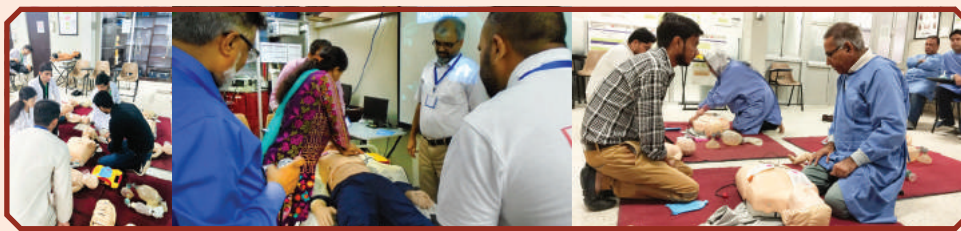
BLS for K-Electric

Research and Skills Development Centre is an American Heart Association Accredited Training center in Pakistan, providing BLS & ACLS courses on the latest AHA 2020 guidelines. The course comprises how to assess cardiac arrest victim, delivering high quality CPR for adults, children and infants; how to incorporate steps in the Chain of survival. It also includes how to deal with choking for all age groups. RSDC has conducted a total of 39