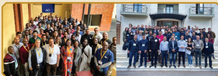
AO Trauma Course

AO Trauma is an international community of trauma and Orthopaedic surgeons which is committed to promoting excellence in patient care and outcomes in trauma and musculoskeletal disorders. The Department of Orthopaedics LNH is proud to announce that five Orthopaedic residents from LNH attended the AO Trauma – Basic Principles of Fracture Management course in Athens, Greece and Nairobi, Kenya this year. A few residents also participated in the AO Trauma-Advanced Principles of Fracture Management course in Lahore, Pakistan as well.