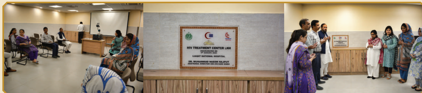
CDC- Pakistan, HIV Treatment Center at Liaquat National Hospital and Medical College

counselor for HIV-related issues will be available for guidance of patients and their families. This program will operate through Infectious Diseases OPD, Liaquat National Hospital.