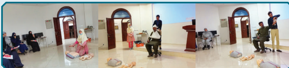
Friends and Family Activity at PNFS

Research and Skills Development Centre conducted sessions for students and faculty members of PNFS in August 2023. Sessions were planned to enhance the skills for Hands only CPR and Emergency Response and a total number of 12 participants attended the sessions.