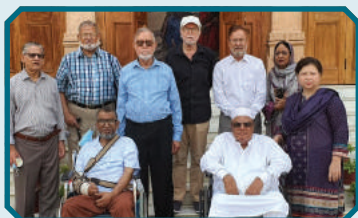
Enchanting Glimpses of Seniors Finding Solace and Spiritual Grace during their Cherished Visits

A group comprising of 11 members of Senior Citizens Primary Care Unit (SCPCU) paid a visit to Mohatta Palace on August 26 th 2023.