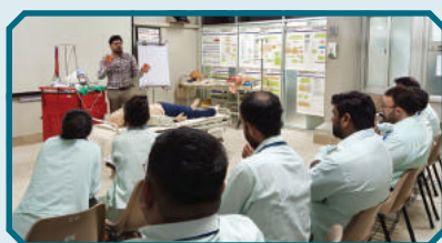
N-AART Session with Nurse