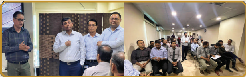
An Awareness Session on World No Tobacco Day at Salam Takaful

Along with that, he discussed proactive steps to quit smoking and building a healthy lifestyle. About 100 employees of Salam Takaful attended the session and acknowledged the impact of tobacco. In the end, there was a Q&A session where attendees were left with heightened awareness and a clearer path towards healthier choices.