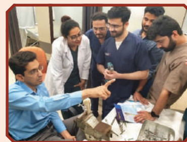
Sawbone and Casting Workshops