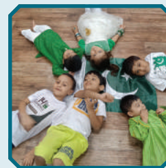
Showing Happiness During Celebration of Independence Day