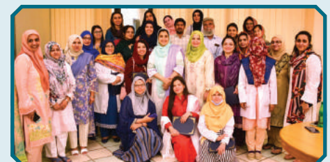
PGCERT FM Participants Feeling Accomplished and Celebrating

the occasion with his presence and awarded the certificates to successful participants and distributed