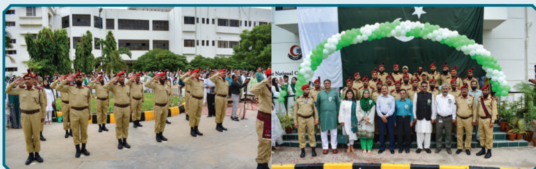
The 76 th Independence Day Celebrations at Liaquat National Hospital