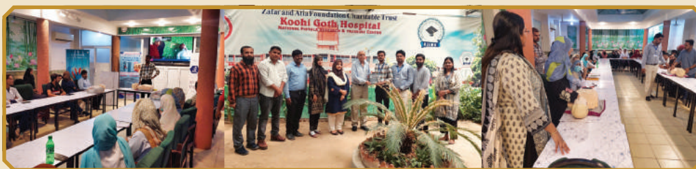
Awareness session At Malir University

Research and Skills Development Centre conducted sessions for students and faculty members of Malir University in July 2023. Sessions were planned to enhance the skills for Hands only CPR and a total number of 60 participants attended the sessions.