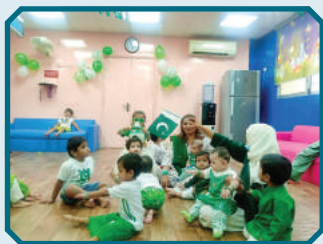
Singing National Song

Independence Day was celebrated with enthusiasm at Baby Day Care, LNH. The staff prepared different activities like paper crafting, coloring, face painting, blowing balloons, storytelling and singing national songs for children so they are kept engaged and know the importance of the day.