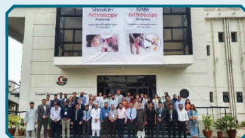
The 4 th Advanced Knee and Shoulder Arthroscopy Workshop

ones previously conducted, these two live surgery workshops explored tools and methods to improve surgical techniques, based on cutting-edge surgical research in evidence-based medicine, aimed to impact loco-regional practice patterns with the ultimate goal of improved patient outcome after knee and shoulder arthroscopy.