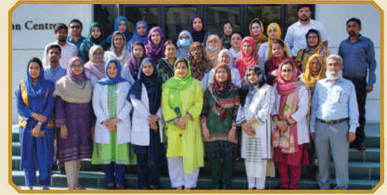
Group Photo with PG Cert Batch 2022-2023