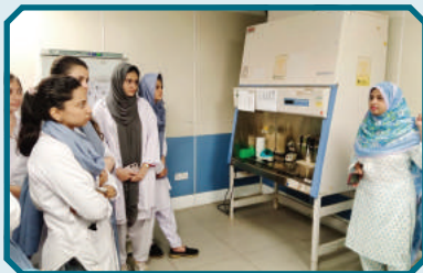
Students of JUW