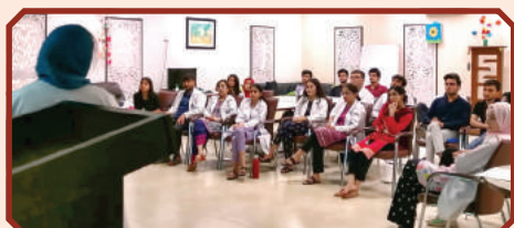
Family Medicine Faculty Presentation on Specific Care Needs of Elderly

The Family Medicine Department organized a tour of Senior Citizens Primary Care Unit for batch 2027 of LPMC. A total of four sessions took place from 27 th July – 30 th July 2023. Our students were