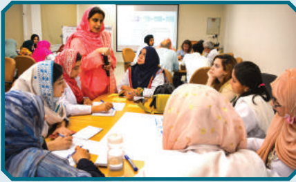
Group Discussion on Application of 5 M of Geriatric Framework into Clinical Practice

On the occasion of World Family Doctors Day, the Department of Family Medicine organized a workshop on Geriatric essentials for Family Physicians. The workshop content was based on the Geriatric 5M approach i.e. Mind, Mobility, Medications, Multi-complexity, Matters Most, which provided participants with an insight into the tools being utilized for comprehensive