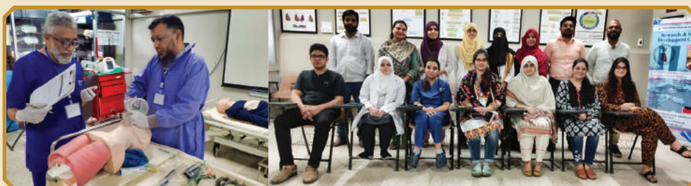
Advanced Cardiovascular Life Support

Advanced Cardiac Life Support is a 2-day practice while watching & Hands on Practice program developed by the American Heart Association (AHA) to improve the skills of emergency practitioners/ doctors/nurses and paramedical staff in emergencies,