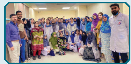
Students of JUW with Faculty & Staff