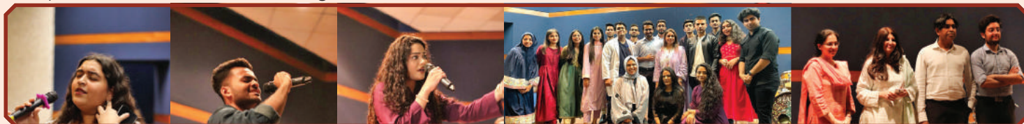
LNH Idol 2.0 by MAD Society

The LNH Idol not only allowed students to showcase their talents but also facilitated new friendships and a sense of belonging within the medical school community. It is a reminder that with the right mindset and support system, even the most challenging circumstances can give rise to moments that will be cherished forever!