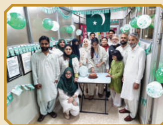
Pakistan Independence Day Celebration

Research and Skills Development Centre celebrated 76 th Pakistan Independence Day 2023 with commitments to prosperity, reforms & defense. Activities performed including beautifully decorating the department with Flags and pennants, cake cutting ceremony, singing National songs, reciting National Anthem by the RSDC staff. The department also attended official event on 14 th August at LNH Convention Centre.