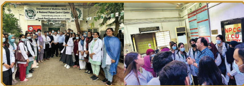
National Poison Control Centre Ward-5 JPMC

The ICU's patients, predominantly victims of animal poisoning and agrochemical poisoning which were accidental and suicidal in manner and were undergoing rigorous treatment, including atropinization, expertly monitored by the attentive staff. Atropinization involves the administration of atropine that counters the effects of certain poisonous substances by blocking specific receptors in the body and they were closely monitored and