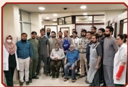
Sawbone and Casting Workshops